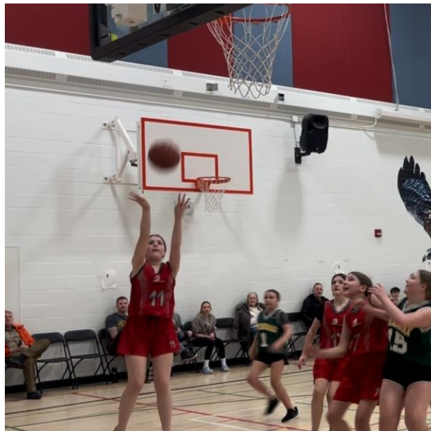
1 - Good luck to our Junior B basketball teams playing at home and in Bragg Creek Friday!

Read-a-Thon Assemblies were held on Thursday, celebrating more than 840,000 minutes of reading and over $14,000 raised by our school to support the purchase of books and literacy resources in our school. See below for further details and some pictures of our celebrations. SOAR Awards were also presented at the assembly, seeing several students in each grade recognized for demonstrating Spirit, Outstanding Character, Achievement, and Respect & Responsibility in amazing ways this month.