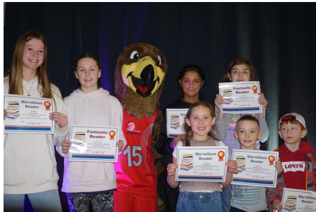
13 - Draw Prizes for 500 & 600 minutes, kindly sponsored by Cochrane Movie House.