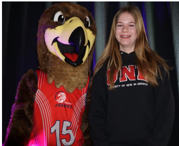
3 - SOAR Awards