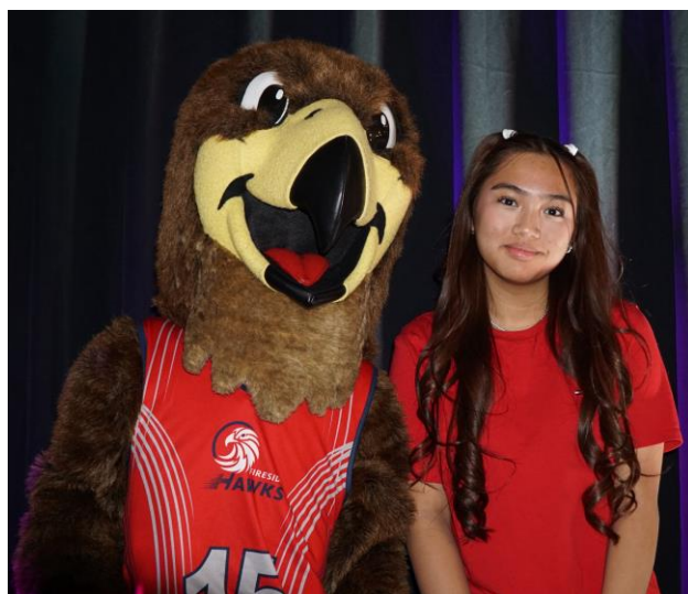
4 - SOAR Awards