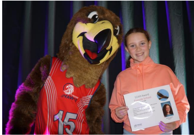
2 - SOAR Awards