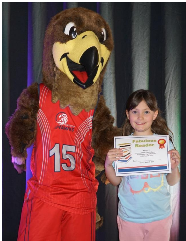
8 - Top Fundraiser