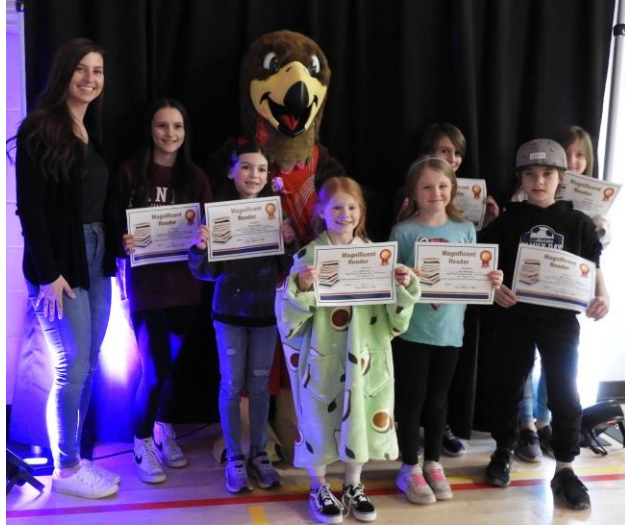
9 - Draw Prize Winners for 1100 & 1200 Minutes (kindly sponsored by Friends of Fireside)

Read-a-Thon Celebration Assemblies were a huge success on Thursday, seeing 127+ students receiving prizes and awards. Paired with our SOAR Assemblies, students in K-8 attended to see who had won the sponsored draw prizes for reaching reading benchmarks and who were the top readers and fundraisers this year.