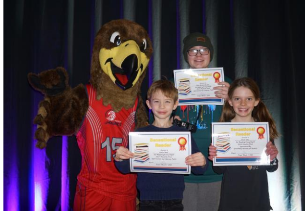
14 - Read Every Day Draw Prize Recipients (kindly sponsored by Calaway Park, The Messy Moose Art Studio, and SLS Centre)