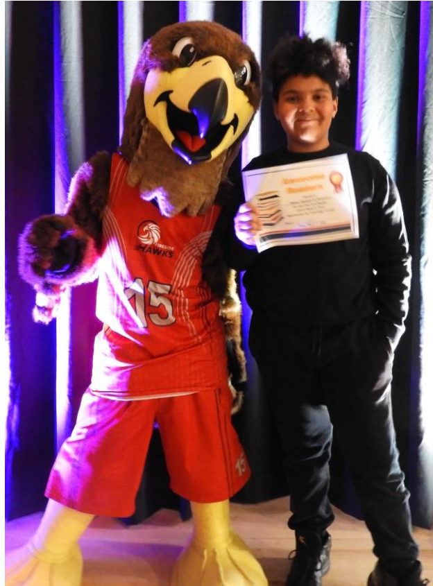
6 - Top Individual Reader: 11,014 minutes (kindly sponsored by Bow Valley High School Performing Arts -- the recipient received a "GOLDEN TICKET" for his family to attend Willy Wonka)