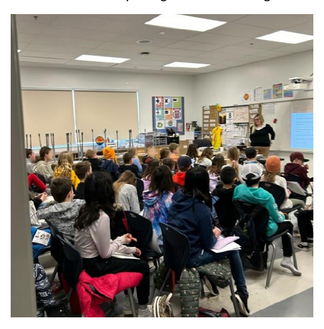
1 - Home Alone and Babysitting class this past weekend.

Although it was cold and snowy this week, students were still able to go out for recesses and outdoor classroom activities and learning. As part of their leadership goals for PE, Grade 6 students in Ms. Duong's class take the lead to make a lesson for their peers; this week, one lesson included team snowman building as part of the activity. Grade 7/8 Outdoor Education classes held a cookout on the compound for their final class this week, showing off the outdoor cooking skills they'd learned over the term, and Grade 7 students were cross-country skiing and snowshoeing on our fields for PE.