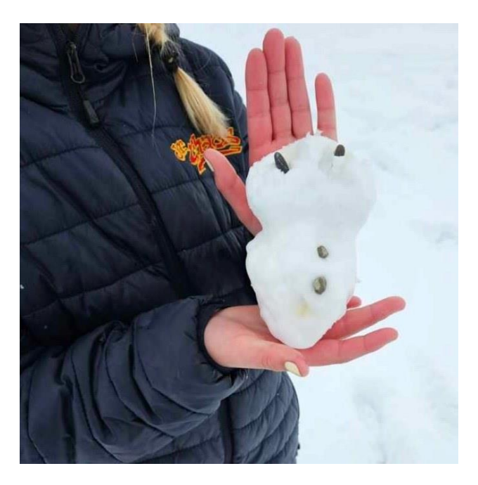
2 - Grade 6 Team-building Snowman