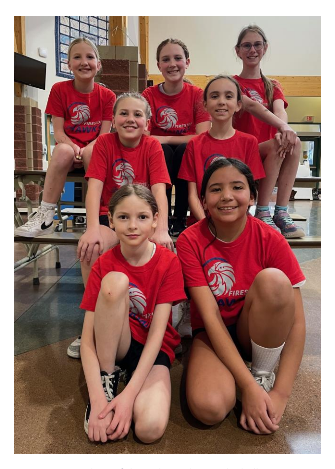
7 - Members of the Girls Grade 6 Basketball Team