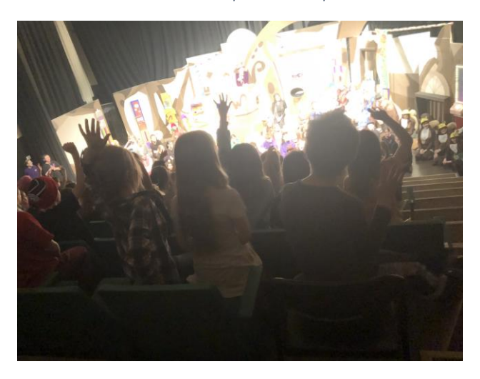
2 - Grade 3s and 2/3s at Willy Wonka's Charlie and the Chocolate Factory Q&A session