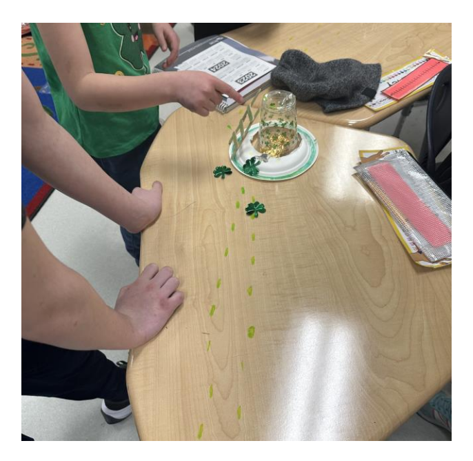
1 - Grade 1 leprechaun traps