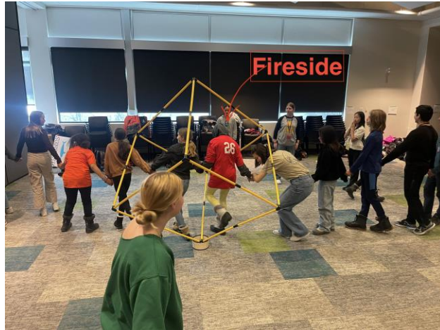
1 - MSLC Teamwork Activity