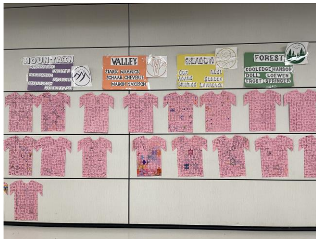
2 - Pink Shirt Day Posters