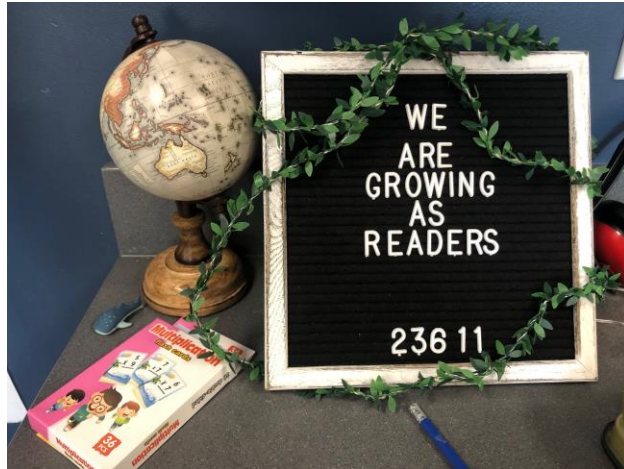
6 - Grade 5 Reading Minutes Display