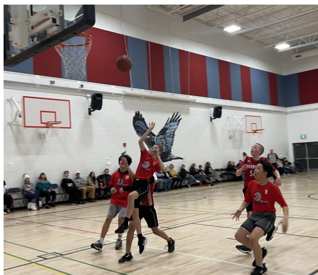
3 - Junior Boys B Basketball