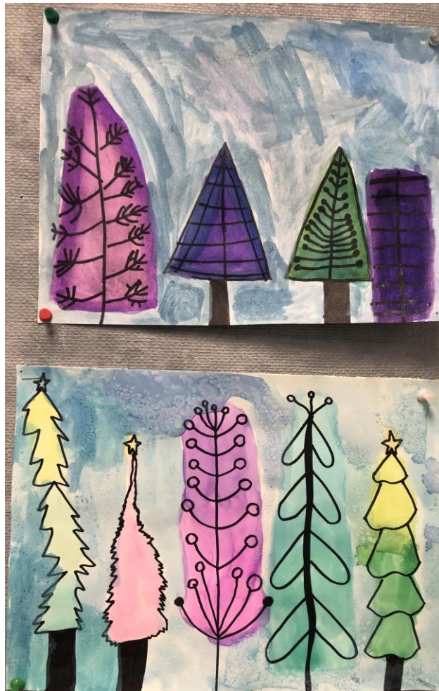
3 - Grade 3 Watercolour Trees