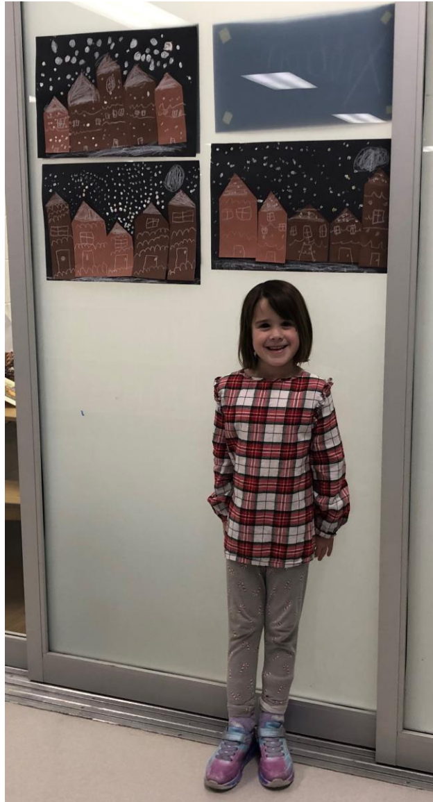
1 - Grade 1 Snowy Community