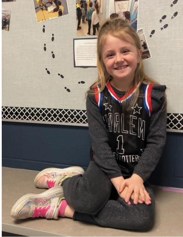
4 - Jersey Day!