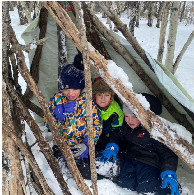
2 - Kinders at Fireside Forest