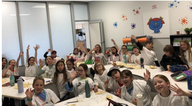
5 - Battle of the Books competitors