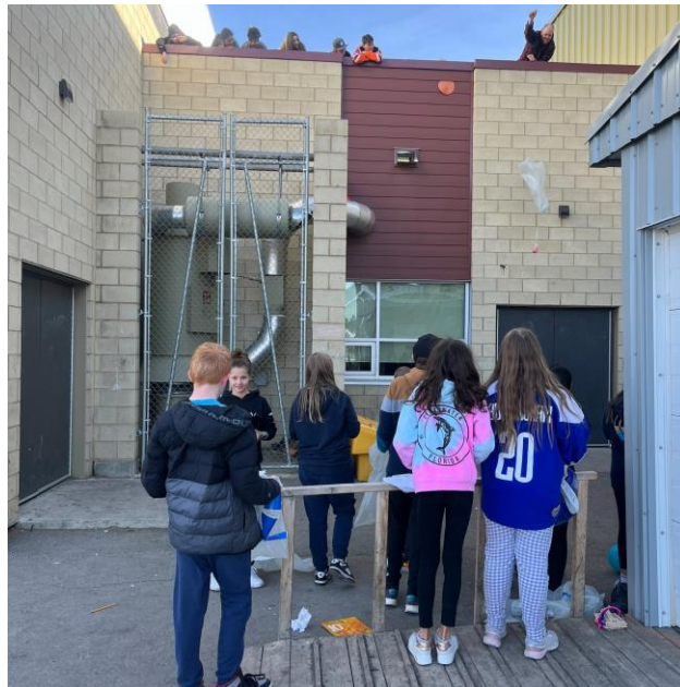
6 - Mrs. Pare's Grade 6 class tests out their designs for keeping raw eggs safe when dropped from our school's outdoor observation deck.