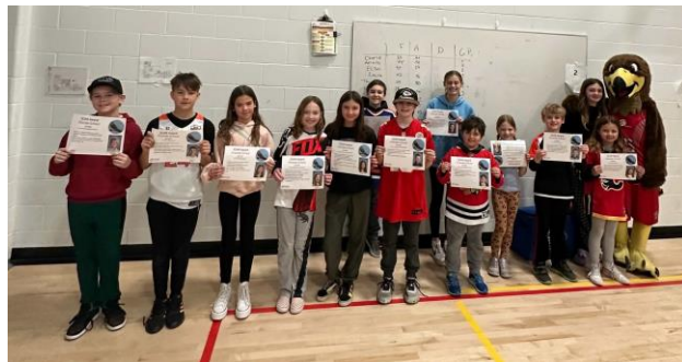
10 - Odd-numbered grades SOAR recipients