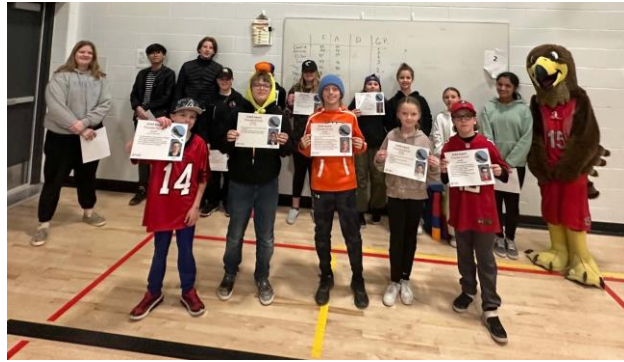
9 - Even-numbered grades SOAR recipients