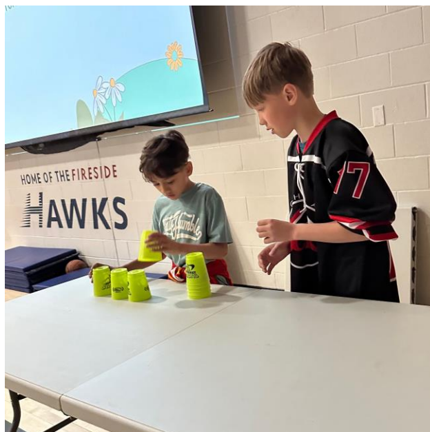
11 - Fireside Families cup stacking challenge