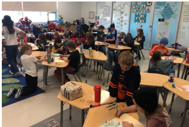
13 - Grade 2 and Grade 4 buddies welcoming spring with poetry and paper flowers