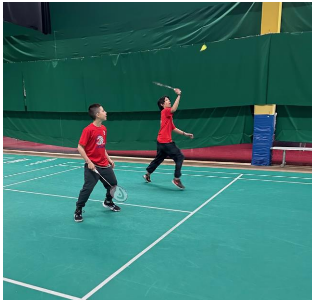
3 - Grade 7 Badminton Divisionals