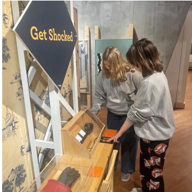
7 - Grade 8 students explored science concepts at Telus Spark