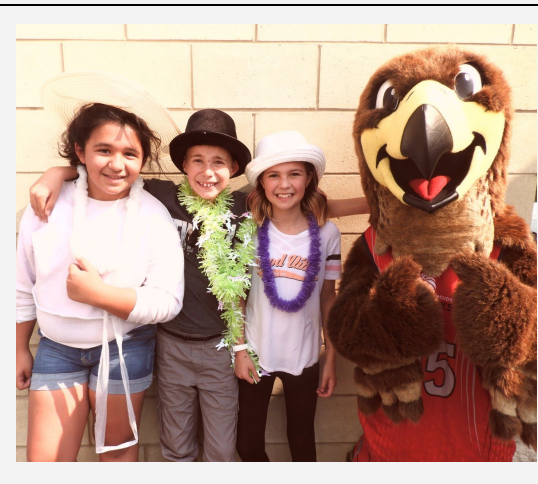
Skylar the Hawk with his new friends.

On the first week of school, Firesider's were surprised and excited to meet Skylar the new Fireside school mascot and by the way did you know that I interviewed him? Guess what his favorite colours are? Skylar's favourite colours are the school colors (grey, blue and red)! By the way did you know that his favourite sports are soccer and hockey? Skylar likes to play soccer and hockey because he gets to run and skate a lot. Have you ever wanted to know what Skylar's favourite part of his job is? Skylar's favourite part of his job are the events that take place at Fireside school. Skylar's most,most favourite type of event are the school assemblies. Skylar especially likes the assemblies because everyone is together in one place and at one time. I also asked Skylar what his favourite holiday was throughout the year. He was not sure because there are so many great holidays but he gave it some thought and decided that he especially liked Halloween. Skylar decided he liked Halloween because you get to dress up in a costume and go trick or treating. I had a wonderful time meeting and interviewing Skylar. Finally, Skylar said he is super excited for the next assembly when he can see you all again!