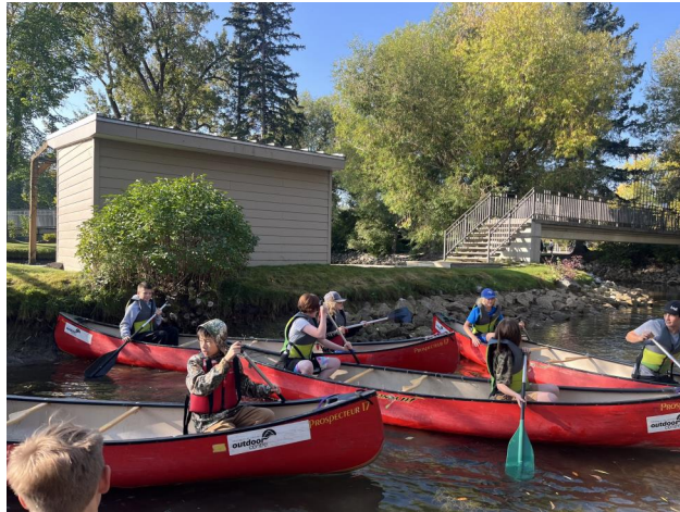
3 - Grade 7&8 Outdoor Education Option Class - Bowness Park!