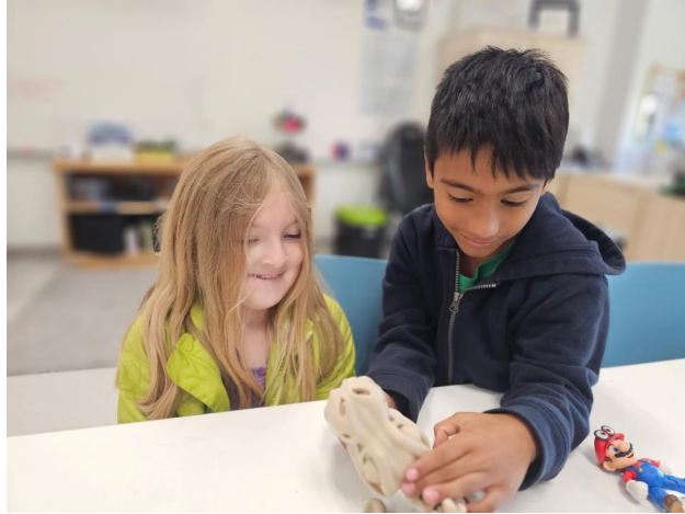
2 - Grade 2s - Working together to learn!