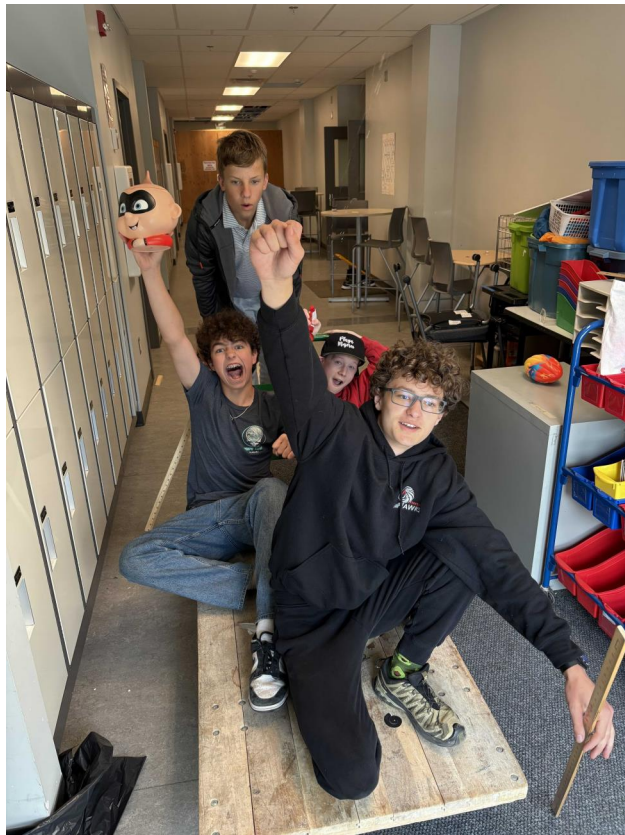
4 - Members of our moving crew