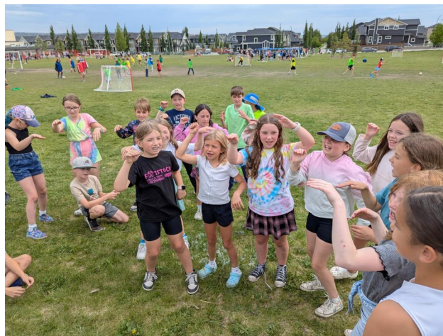
2 - Carnival fun...look at all the smiles on the kids AND adults!!! Thank you everyone who made this day possible!!!