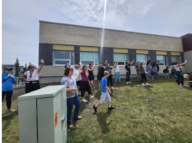
5 - Waving good-bye to the buses...we will miss you!