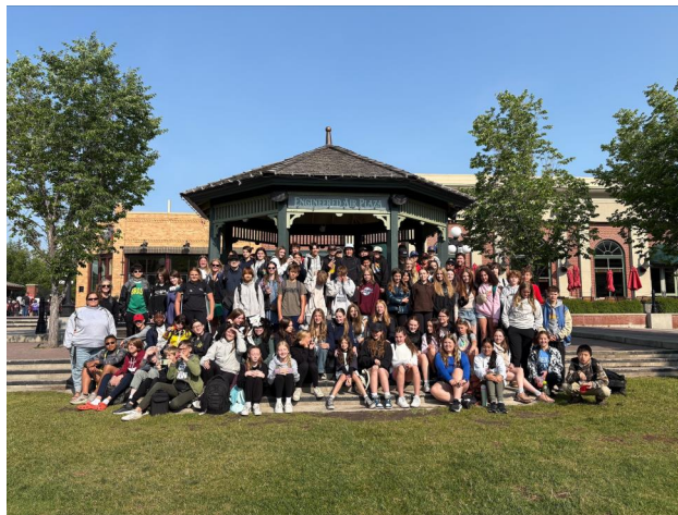
1 - Grade 7s at Heritage Park