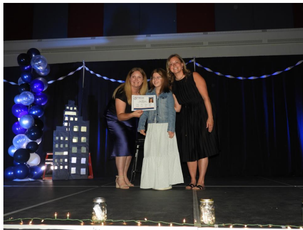
3 - Grade 8 Farewell