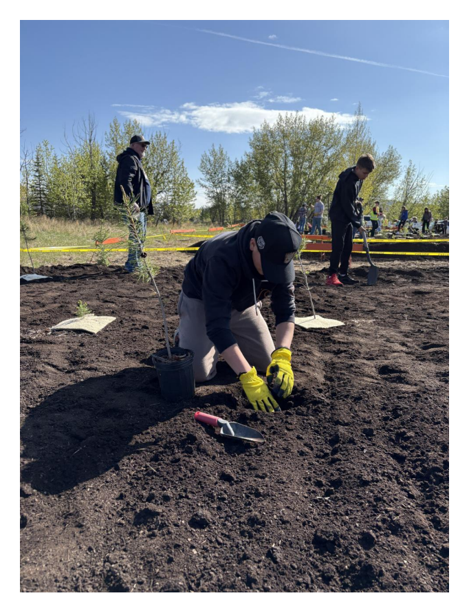
3 - Student Leadership does some tree planting at Mitford Pond