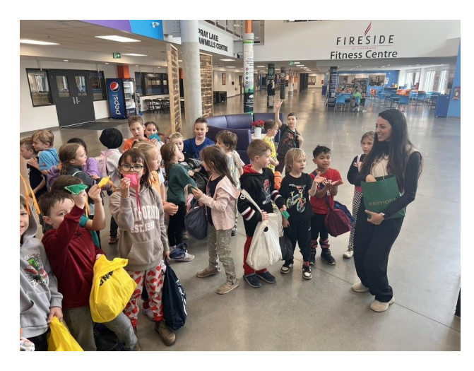
2 - Grade 2s donate cat toys to the Cochrane Humane Society

1 - Outdoor Ed students prepare for their camping trip with some tent practice.