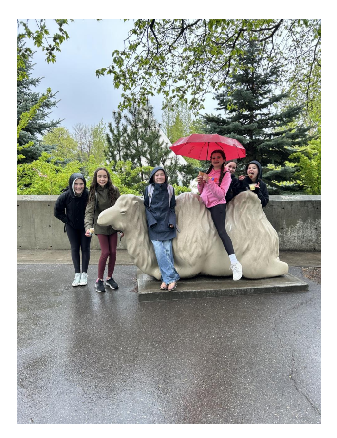
4 - Grade 7s were a little damp at the Zoo