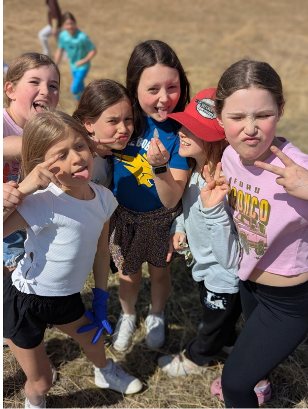
2 - The weather has changed and we are loving it!