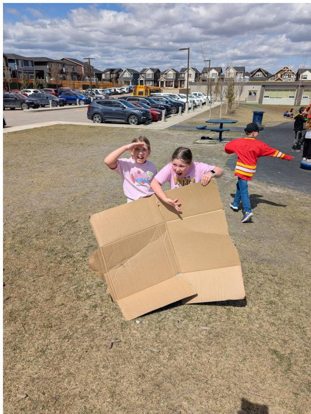
3 - Community Clean Up has started