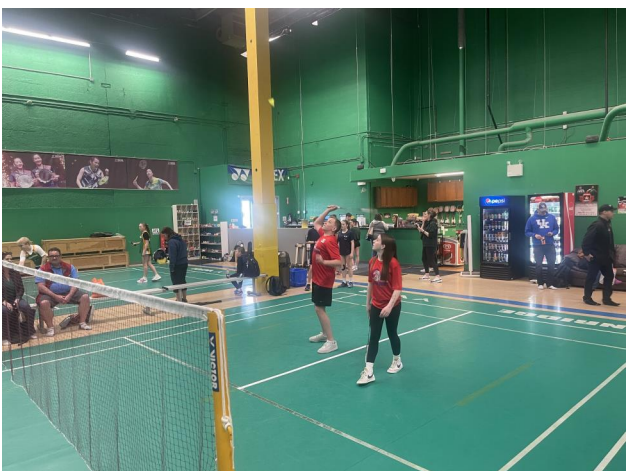
4 - Our Fireside Hawks represented well at the Grade 8 Badminton Tournament.