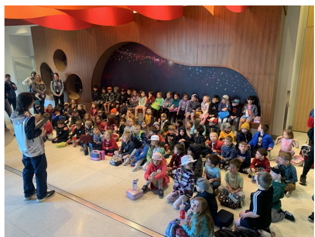
6 - Grade 1s on their Telus Spark field trip.