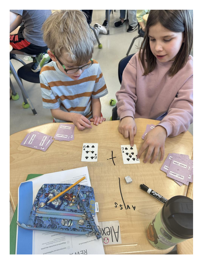
2 - "Addition Snap" in Grade 4