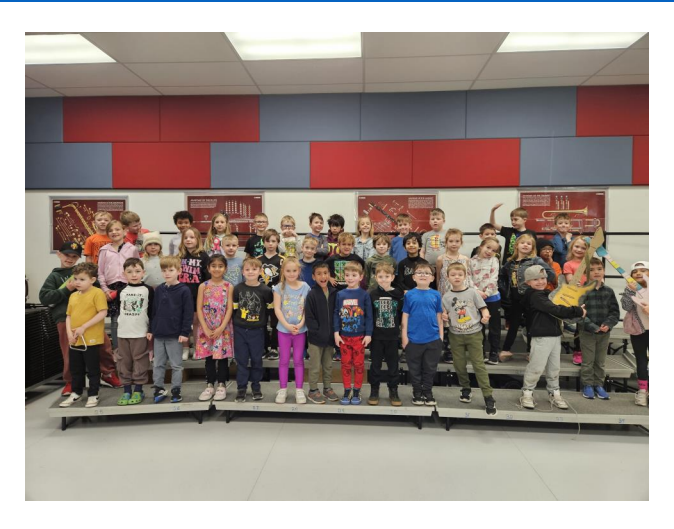
1 - Rehearsals for Tuesday's concert continue!

here: https://www.signupgenius.com/go/10C0A44A5AC28A0FDC16-55192814-casino#