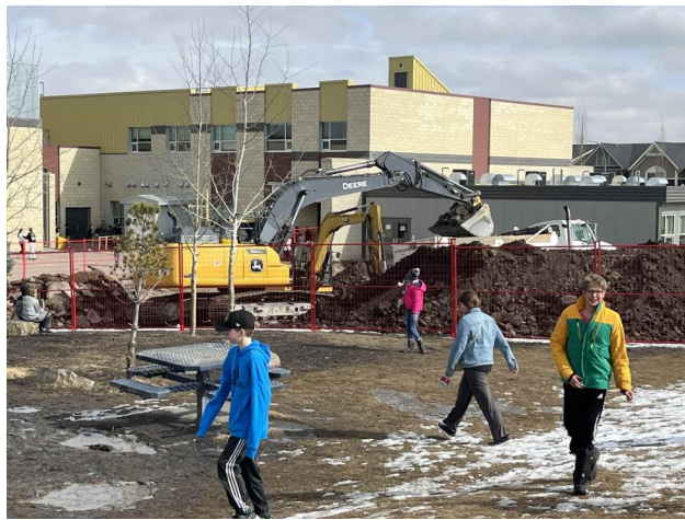
4 - Construction has started!