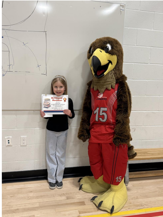
1 - Read-a-Thon Winners