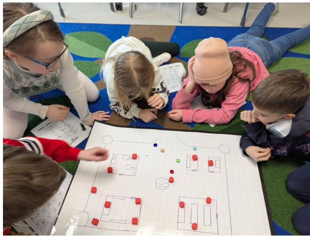
7 - Grade 4 Magnet Exploration