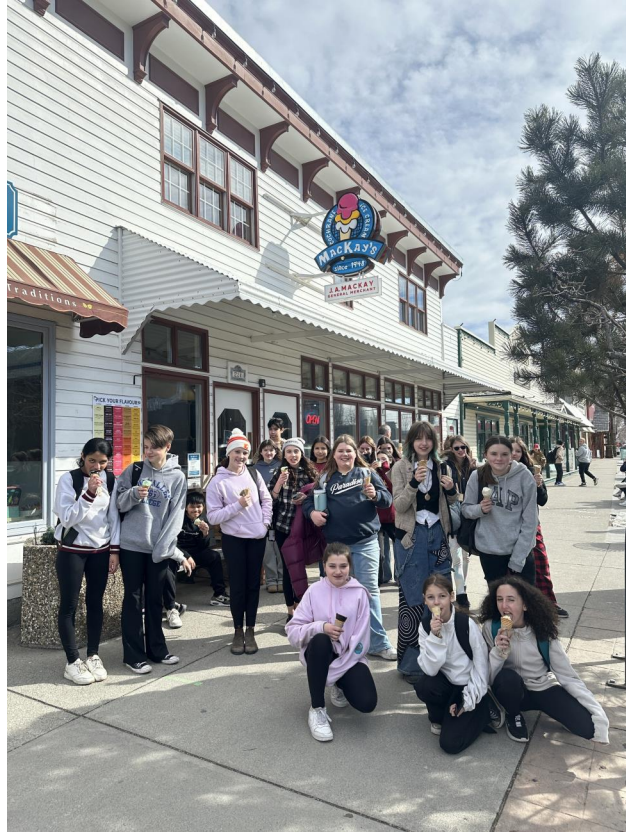
8 - French Class at MacKay's