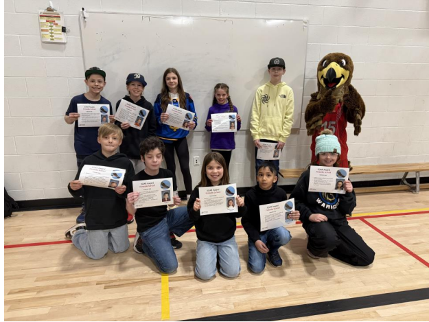
2 - SOAR Awards