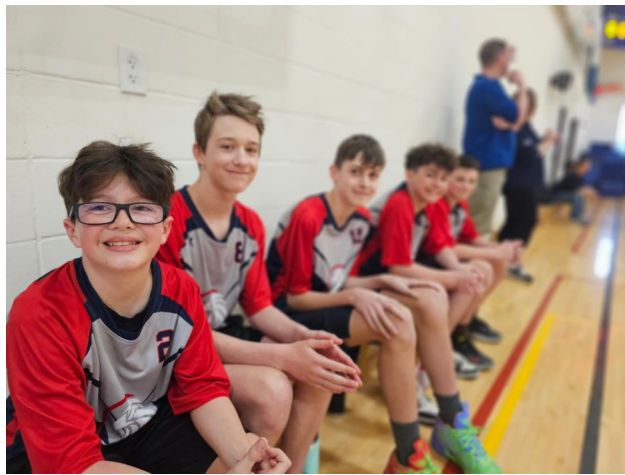
5 - Basketball!