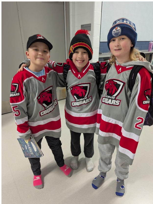
3 - Identicals Day