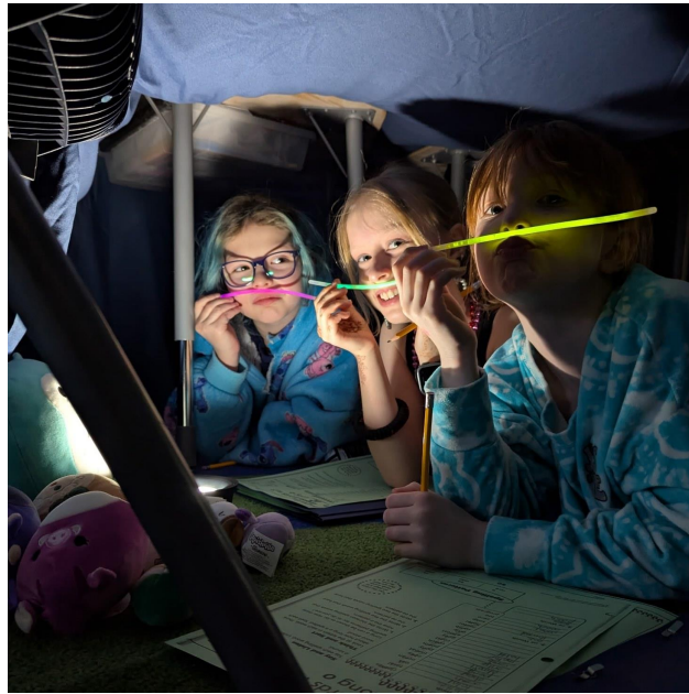
3 - Valentine's Day Desk Forts