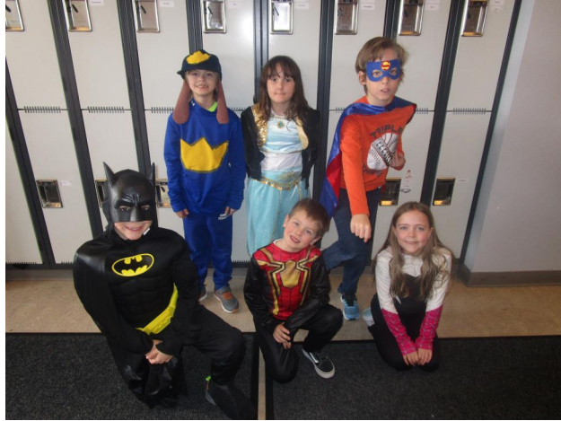
1 - Dress as Your Favorite Character Day