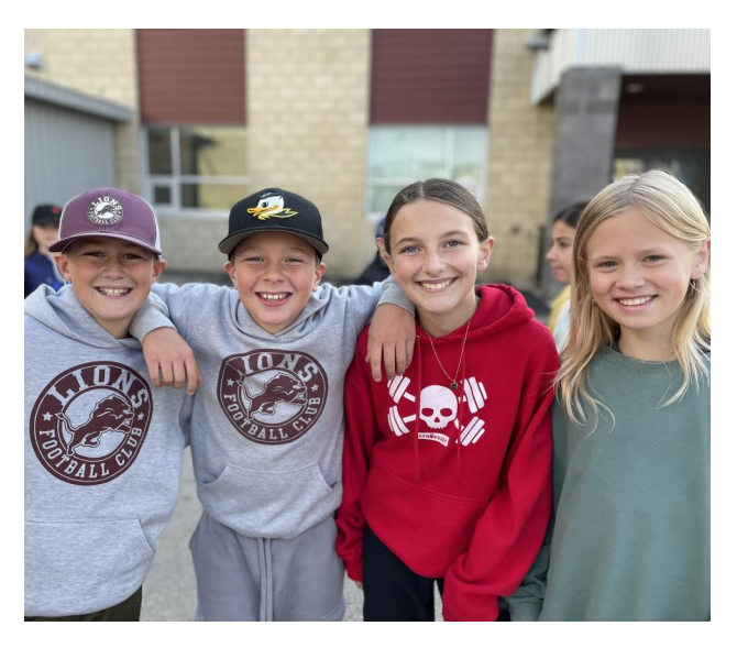
3 - All smiles being back at school on Monday! (editor's note: this photo may or may not have been taken on Monday)

2 - Some Grade 5 Air & Aerodynamics testing of carefully engineered aircraft.