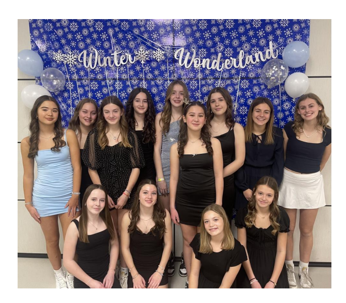
2 - Dance Decoration Committee