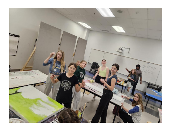
4 - Set preparations