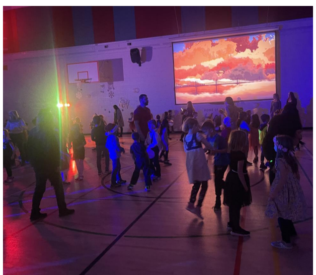
1 - The Snowball Dance!