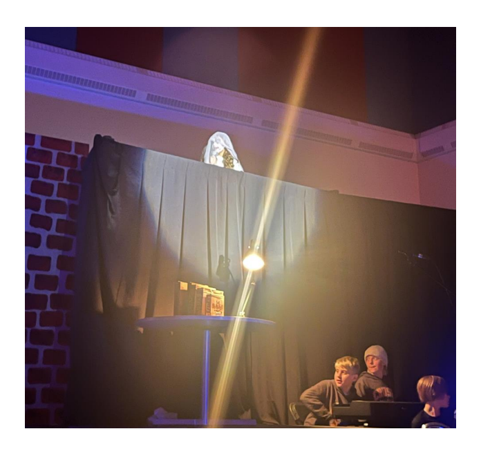
Reminder: Volunteer Opportunities

As we head into the holidays, we want to thank all of the volunteers that have been in our school, on field trips, or helping behind the scenes to help bring opportunities to our students. There have been so many great stories from those volunteering on how much they enjoyed their time in the building! In the New Year, please check back for more opportunities!