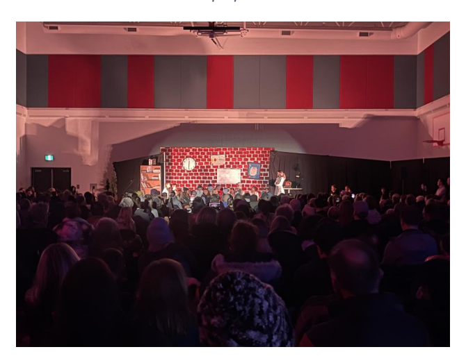
5 - Fireside School Presents: School Spirit, the Musical