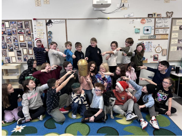
4 - Move over Stanley Cup! The Golden Trash Can was the most coveted prize in Fireside School this week.