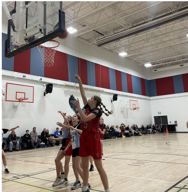
3 - Junior 'A' Basketball season kicked off on Friday with our girls defeating WG Murdoch school from Crossfield.