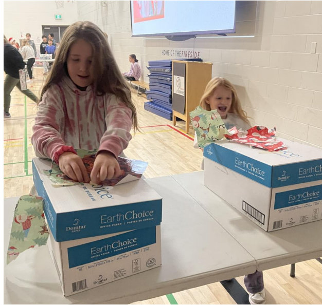
3 - The competition between River and Valley families at our SOAR assembly was fierce! Team speed wrapping is no easy sport!