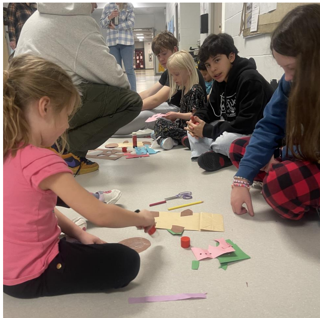
2 - Grade 8s help their Kinder buddies make Gingerbread Man puppets.