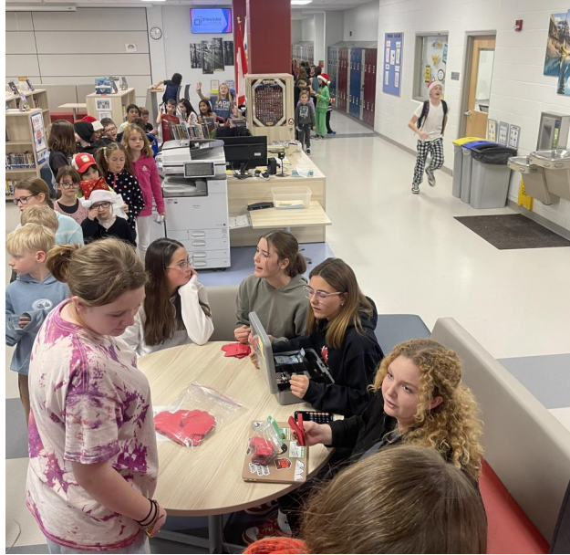
1 - The Candygram line was almost 100 students deep on Thursday!!