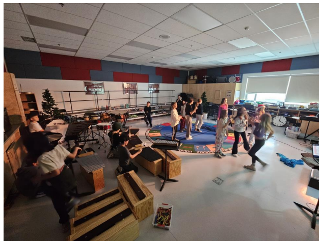
4 - Rehearsals for the upcoming musical were humming along wonderfully this week! (more below)