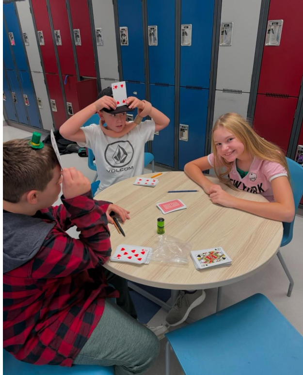
3 - A little game of "Heads Up" in grade 6 for some multiplication fact recall.