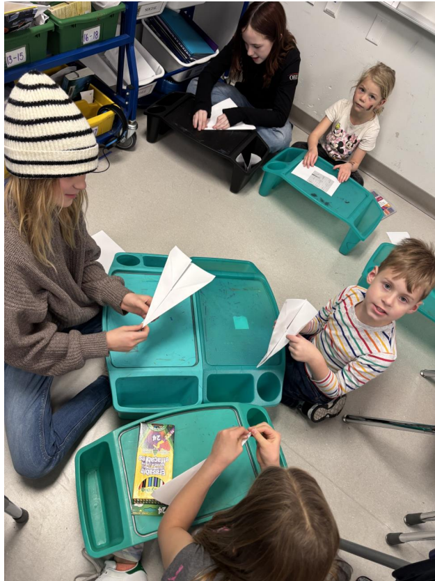
2 - Grade 5 & 8 Buddies help Kinders learn about flight by making paper airplanes.