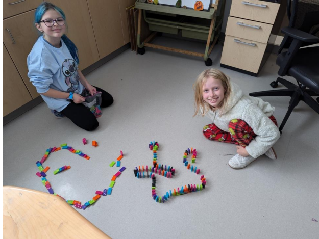
1 - Indoor Recess Fun