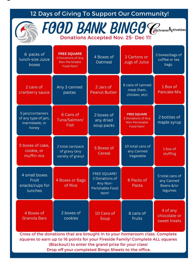
Friends of Fireside

This year, we are working with other RVS schools including Rancheview School as a Cochrane-wide fundraiser for the Actievettes! Stay tuned to see which school wins the school wide competition for bringing in the most donations!