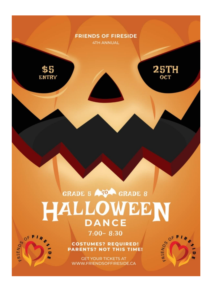
Updated: Volunteer Opportunities