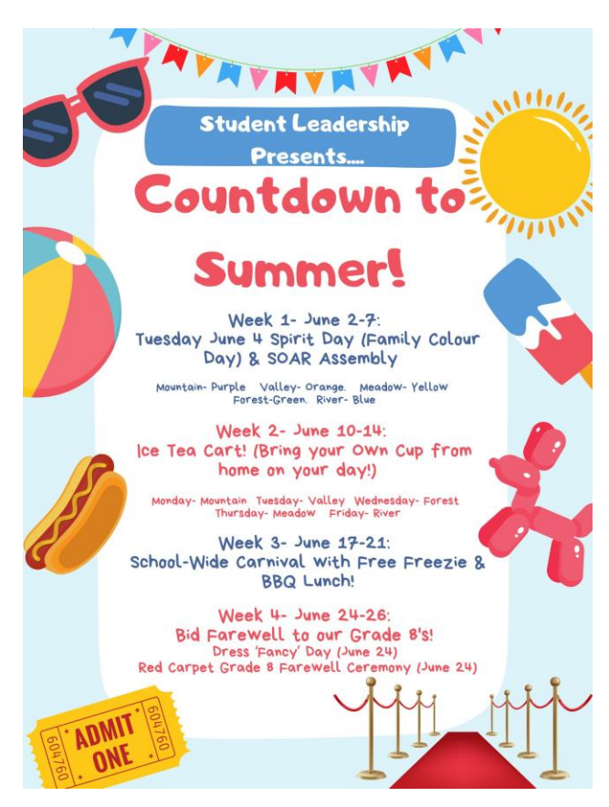
From the Admin Desk