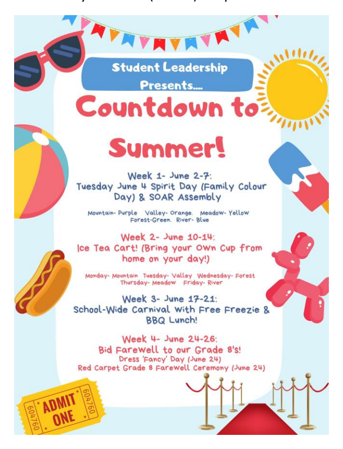
From the Admin Desk