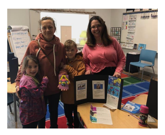
1 - Celebration of Learning Conferences